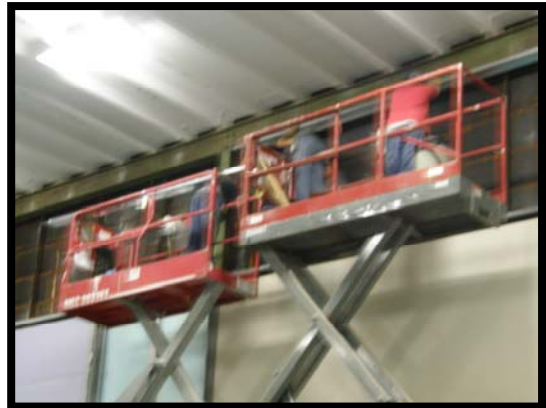
Construction workers have been busy this summer. Renovation work focused on the south side of OHS to remedy problems caused by a leaky roof.