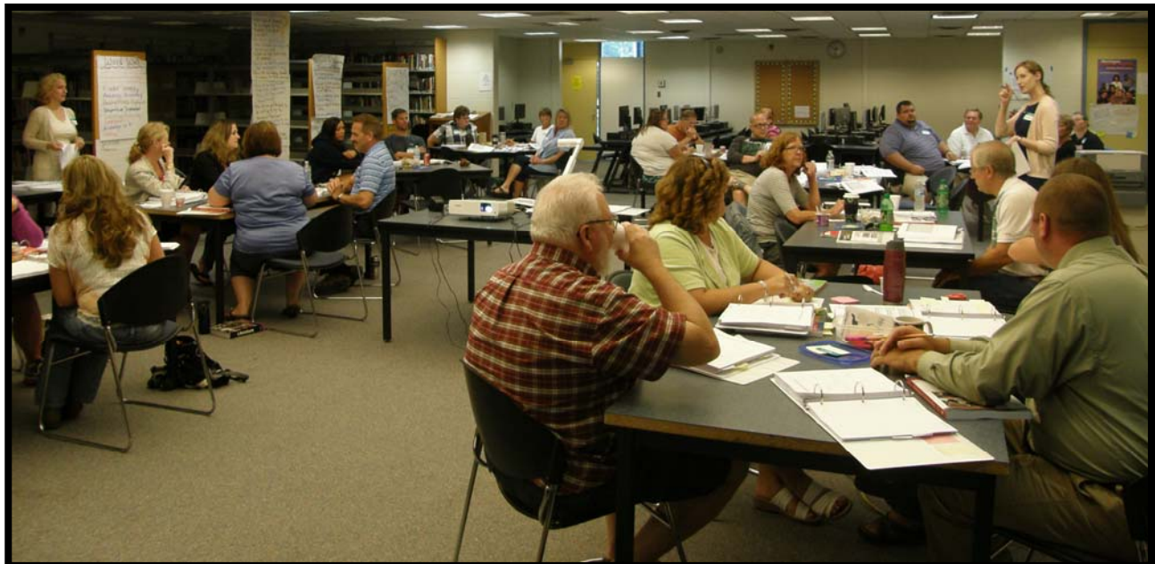
Oscoda teachers have been hard at work this summer learning new strategies to help our children succeed.